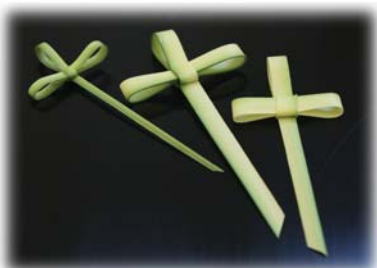
Palm Crosses made by the Sanctuary Guild at last year's workshop